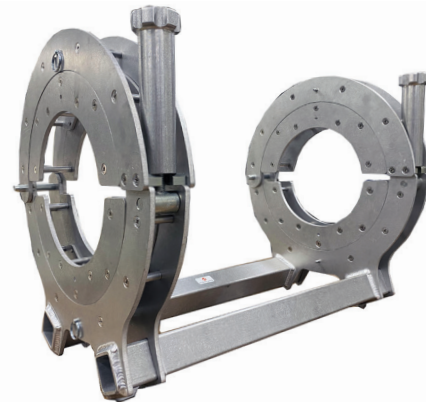
12" IPS Straight Clamp Part # 76060917