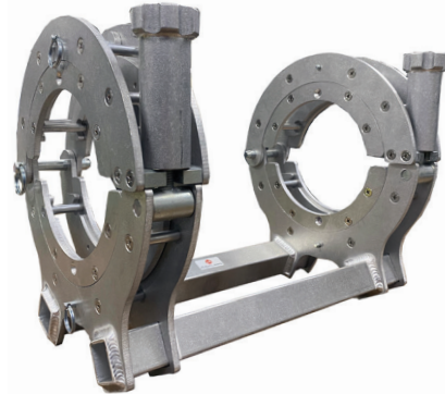
4" IPS Straight Clamp Part # 76670913