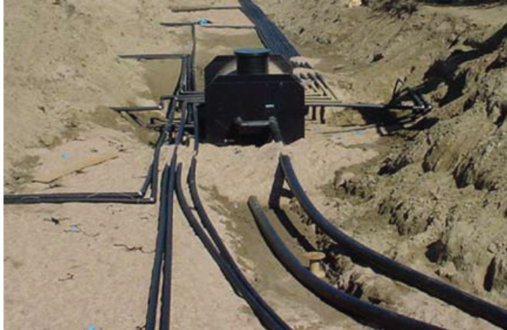
Geothermal well field with ISCO Circuit Maker Vault®

ISCO Industries was founded in 1962 and has grown into North America's largest supplier of high-density polyethylene (HDPE) piping systems. As the leading supplier of HDPE fabricated systems, pipe, fittings, fusion equipment and "know how," ISCO can assist you with your specific piping needs. Whether you are an engineer, end user, public utility, installer, contractor, homeowner or business owner, ISCO has the experience to develop a solution to match your request.