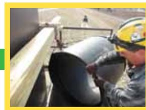
3 Short lengths of pipe, lowered down the manhole one at a time.