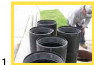
1 Thread-Liner is manufactured in short lengths for easier installation.