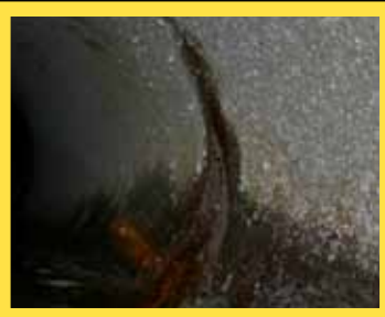
A typical deteriorated sewer, the joints breaking apart and corroding.