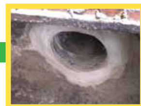
7 This is a totally rehabbed Thread-Liner sewer. No digging or excavating necessary.