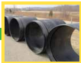
2 Once the host pipe is cleaned out, a member of the crew descends the manhole.